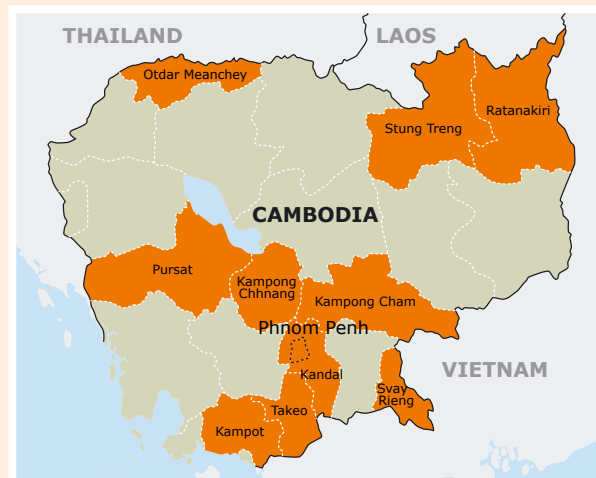
Orange areas show provinces where Alliance2015 partners work in 2012