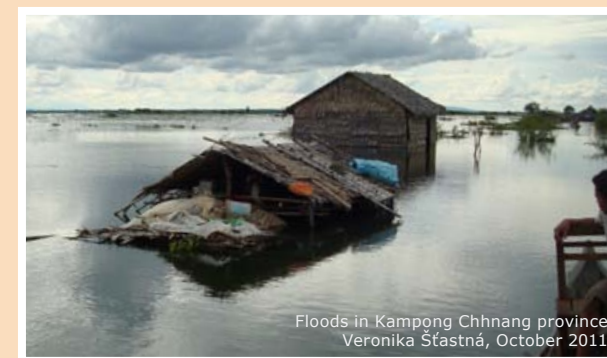
Floods in Kampong Chhnang province Veronika Štastná, October 2011